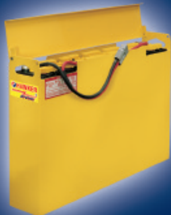
TOP POWER® - The Affordable Power Source

TOP POWER® is the ideal battery for trucks that do not use attachments or trucks that do not operate in harsh conditions.